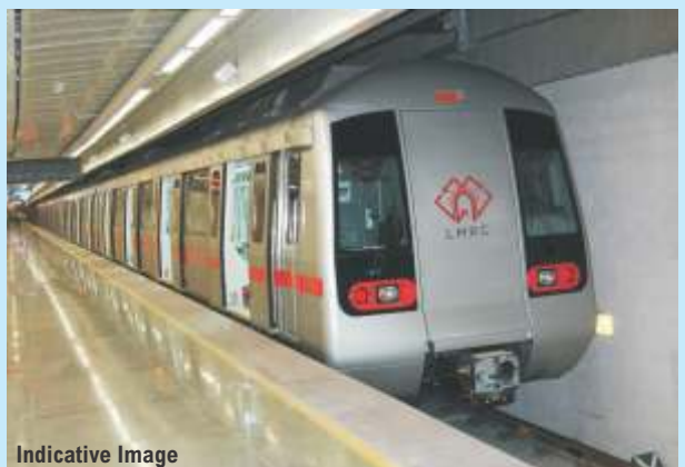
Upcoming Metro in the Vicinity