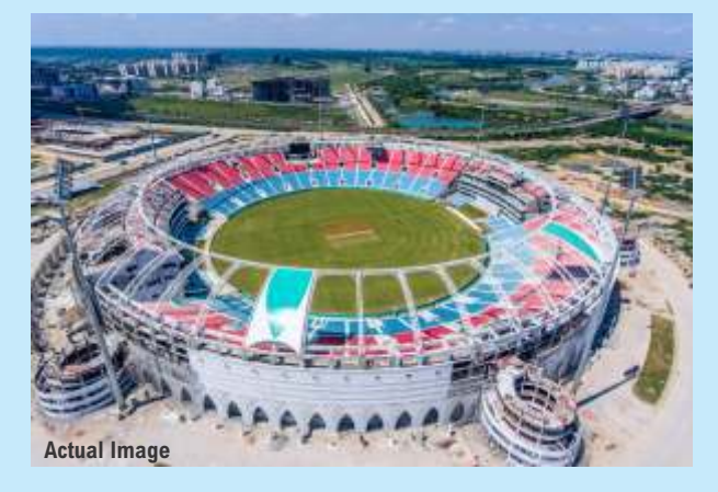
International Cricket Stadium